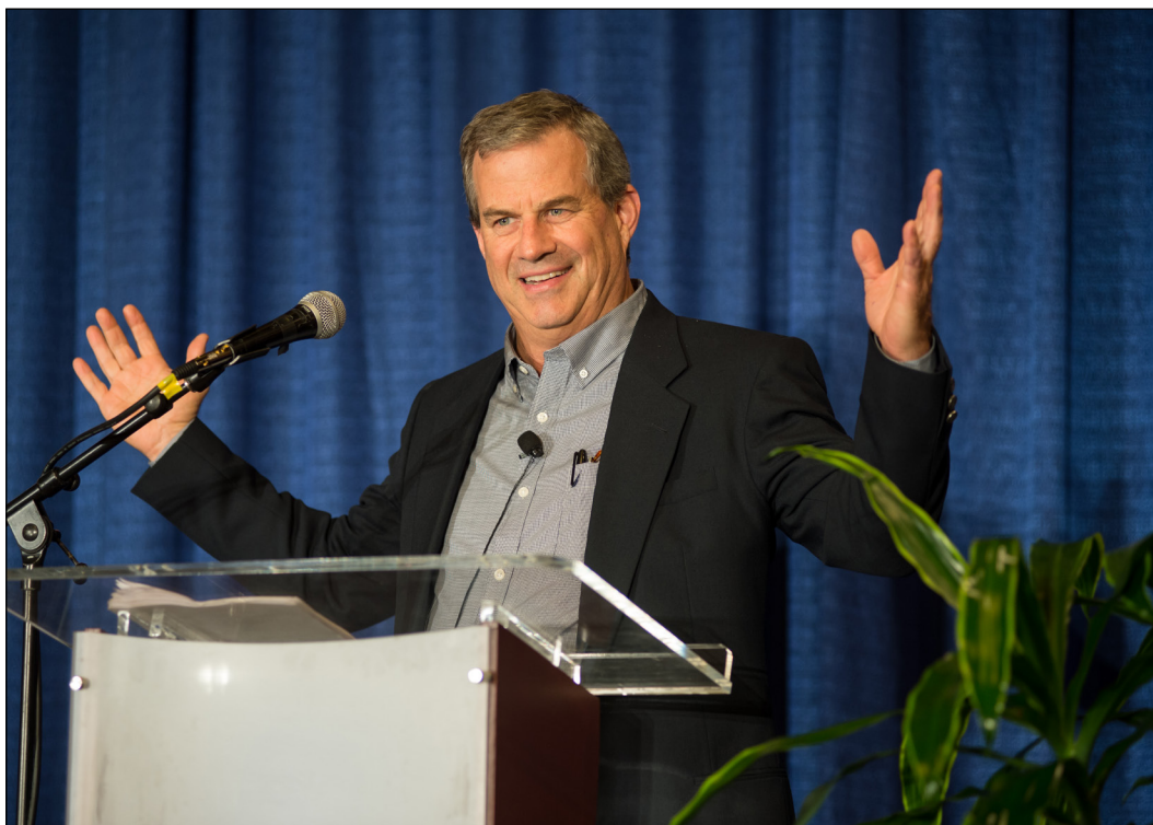
Nationally acclaimed author Sam Quinones spoke at the 2017 Annual Meeting Meet the Mandates session about the emergence of the opioid epidemic as described in his bestselling book Dreamland .