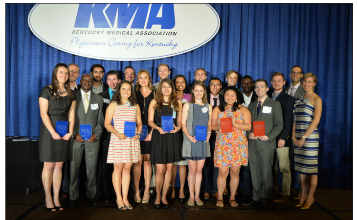
2017 Medical Student Outreach and Leadership Program graduates.

Inspired by the format and success of the Community Connector Leadership Program, the Medical Student Outreach and Leadership Program was designed to engage students early in organized medicine and create future physician leaders through educational sessions and community involvement. In the program's second year, KMA honored 58 medical students during the 2017 Annual Meeting—more than double the number of students from the previous year.