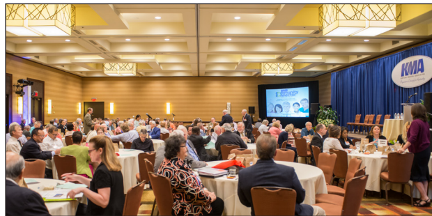
KFMC sponsored KMA's 2017 "Meet the Mandates" education program that included more than 500 attendees.

The KFMC also awarded three grants to organizations that have a relationship with a KMA Community Connector: • The Kentucky Commission for Women Foundation, which