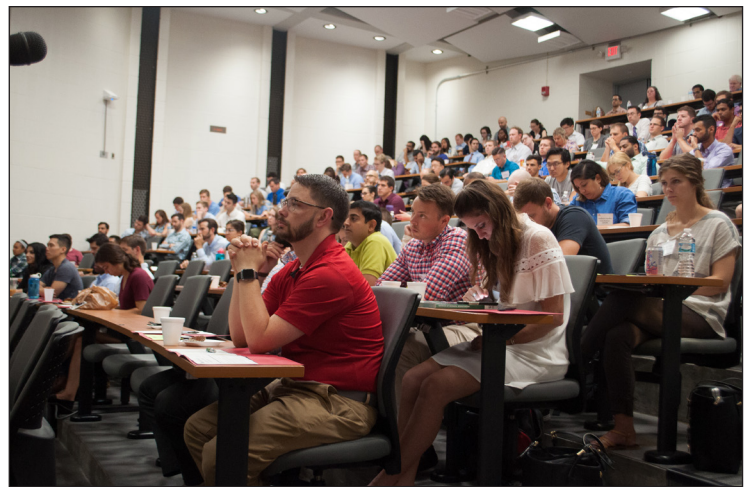
University of Louisville residents at a New Resident Orientation.