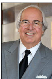
Frank Abagnale, Jr. Security & Fraud Expert Subject of Steven Spielberg's Catch Me if You Can

Saturday, Aug. 25, 10:30 a.m. Louisville Marriott East, Commonwealth CD