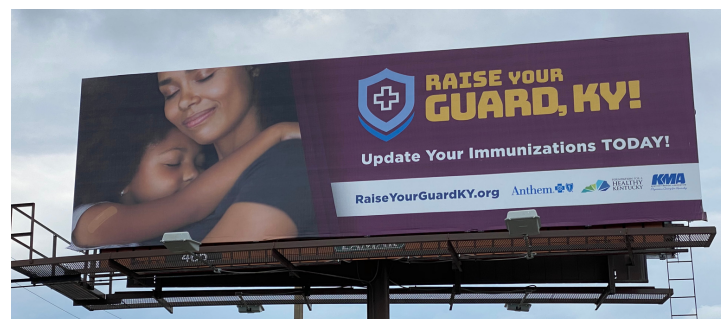
A Raise Your Guard, KY billboard in Louisville

In addition to the video, Raise Your Guard, KY created a website, www.RaiseYourGuardKY.org ( www.levantalaguardiaky.org ), with resources and information on vaccinations and a link to KMA's Physician Finder tool. Information on the website is also available in Spanish.