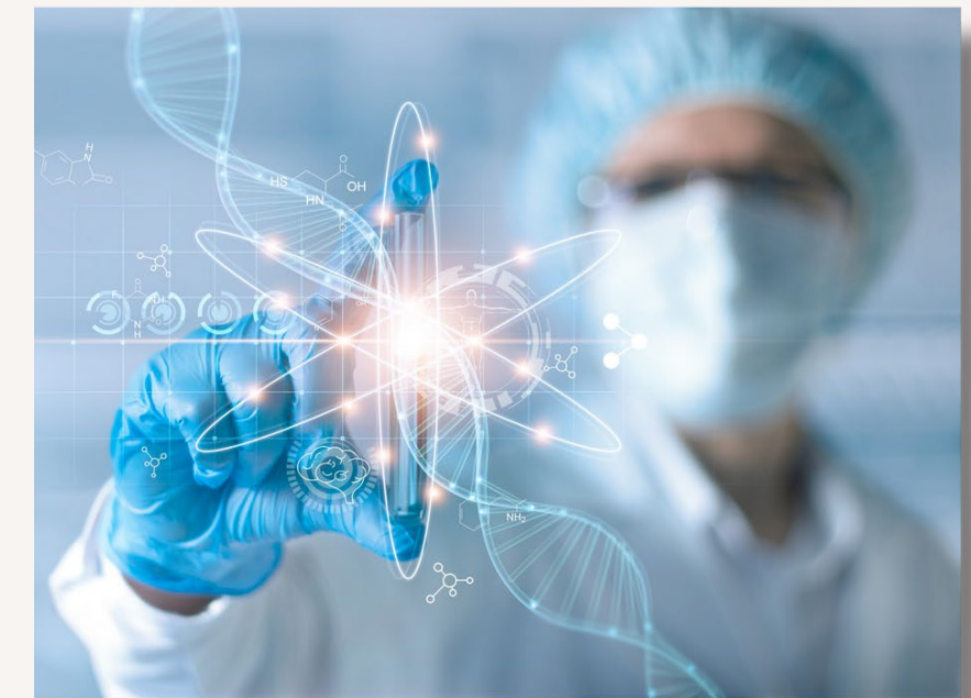
GENETIC BREAKTHROUGHS: TRANSFORMING PATIENT CARE THROUGH GENE THERAPY